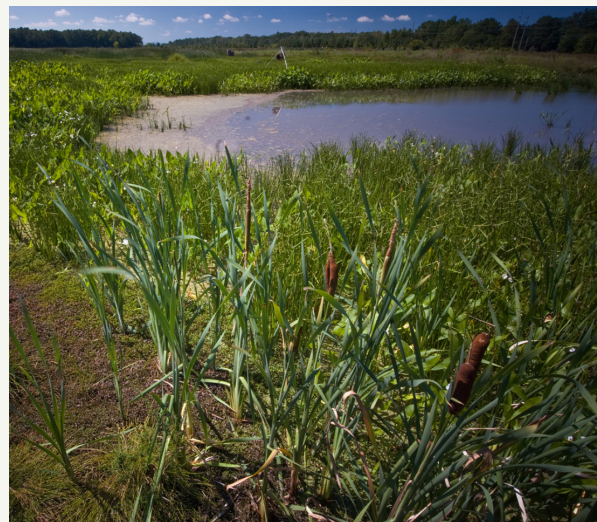
Restoring wetlands can help provide vital habitat for black duck and many other species.