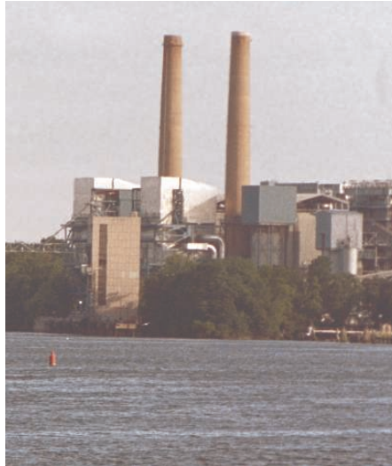
An uncertain future challenges water planners.

In view of the magnitude and ubiquity of the hydroclimatic change apparently now under way, however, we assert that stationarity is dead and should no longer serve as a central, default assumption in water-resource risk assessment and planning. Finding a suitable successor is crucial for human adaptation to changing climate.