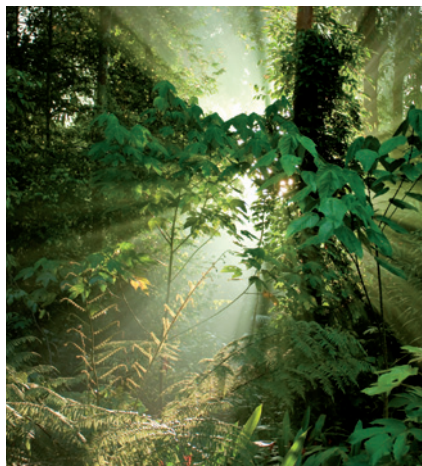
Modelling every organism in an ecosystem such as a tropical rainforest would be impossible.

Over the past two years, we at Microsoft Research and at the United Nations Environment Programme World Conservation Monitoring Centre, both in Cambridge, UK, have built a prototype GEM for terrestrial and marine ecosystems. Called the Madingley model, it uses real data on carbon flows as a starting point. We have hit all sorts of computational and technical hurdles, and are expecting more as we develop the model. Yet the project demonstrates that building GEMs is possible. From the relationship between the mass of individual organisms and how long they live, or the effects of human perturbations such as hunting, to the distribution of