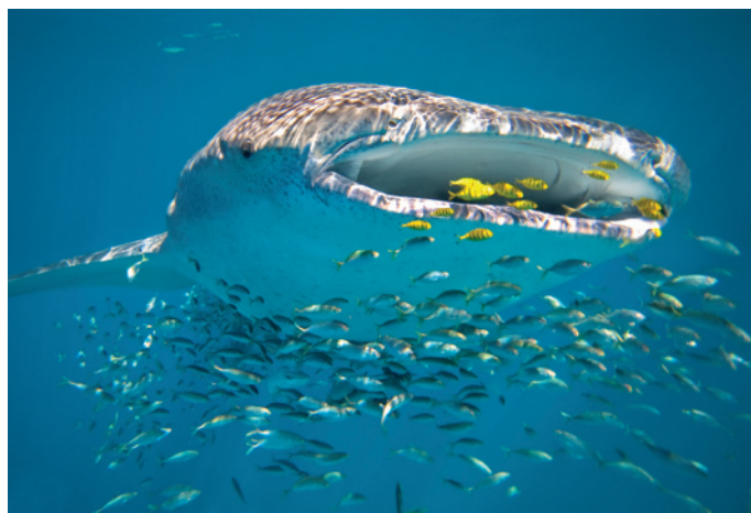
From hunting zebra to filter feeding, the process of predation in all ecosystems plays by similar rules.

Earth.) Yet certain computational techniques have been developed, mainly in marine ecology, that could allow researchers to model entire ecosystems using rules about the behaviour of individuals.